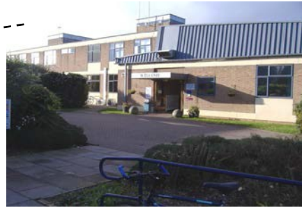
Princess of Wales Hospital